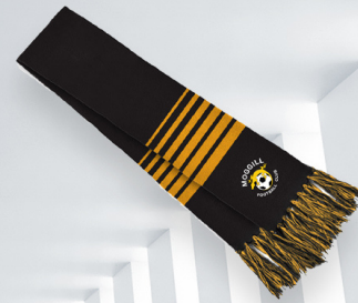
WOVEN SCARF - BLACK-GOLD