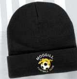
KNITTED BEANIE - BLACK