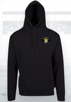
HOODIE - BLACK