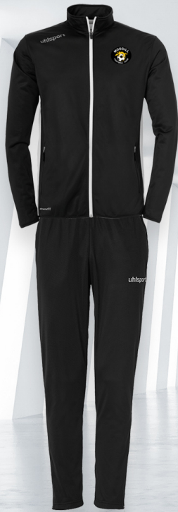
ESSENTIAL CLASSIC TRACKSUIT - BLACK-WHITE