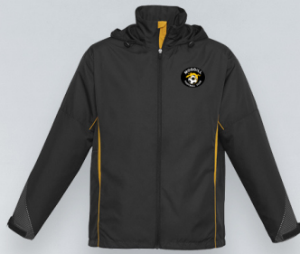
RAZOR SPRAY JACKET - BLACK-GOLD